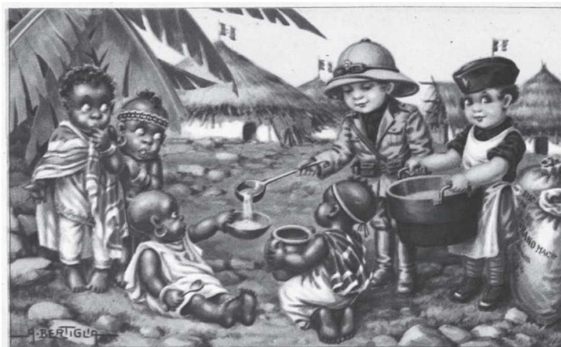
A postcard published in Italy in 1936 showing Italian and Abyssinian children in Abyssinia.

Abyssinia is still a barbarous country. It is violently governed and its government is not strong enough to cope with its own lawless elements. It is entertaining to find a country where the noblemen feast on raw beef, but less amusing when they enslave the villagers of neighbouring countries. The Emperor made himself master of a vast population differing absolutely from himself in race, religion and history. It was taken bloodily and he holds the country by force of arms. The Italians have as much right to govern. In the matter of practical politics it is certain that their government would be for the benefit of Abyssinia and the rest of Africa.