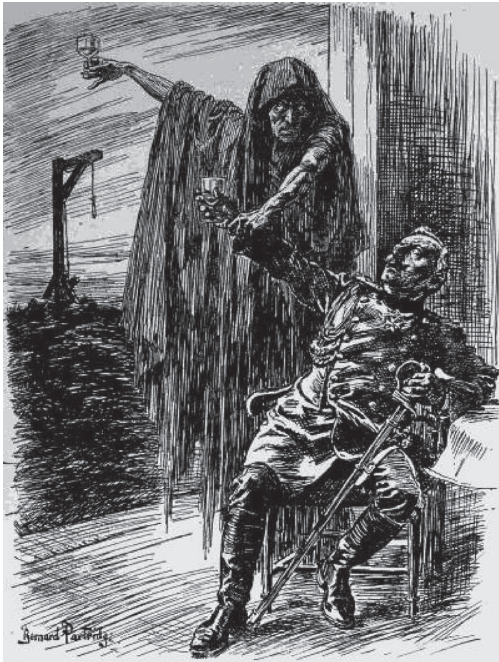
A cartoon published in Britain in 1915. The Kaiser is saying 'To the Day...', but the figure of Death adds the words '...of reckoning!'