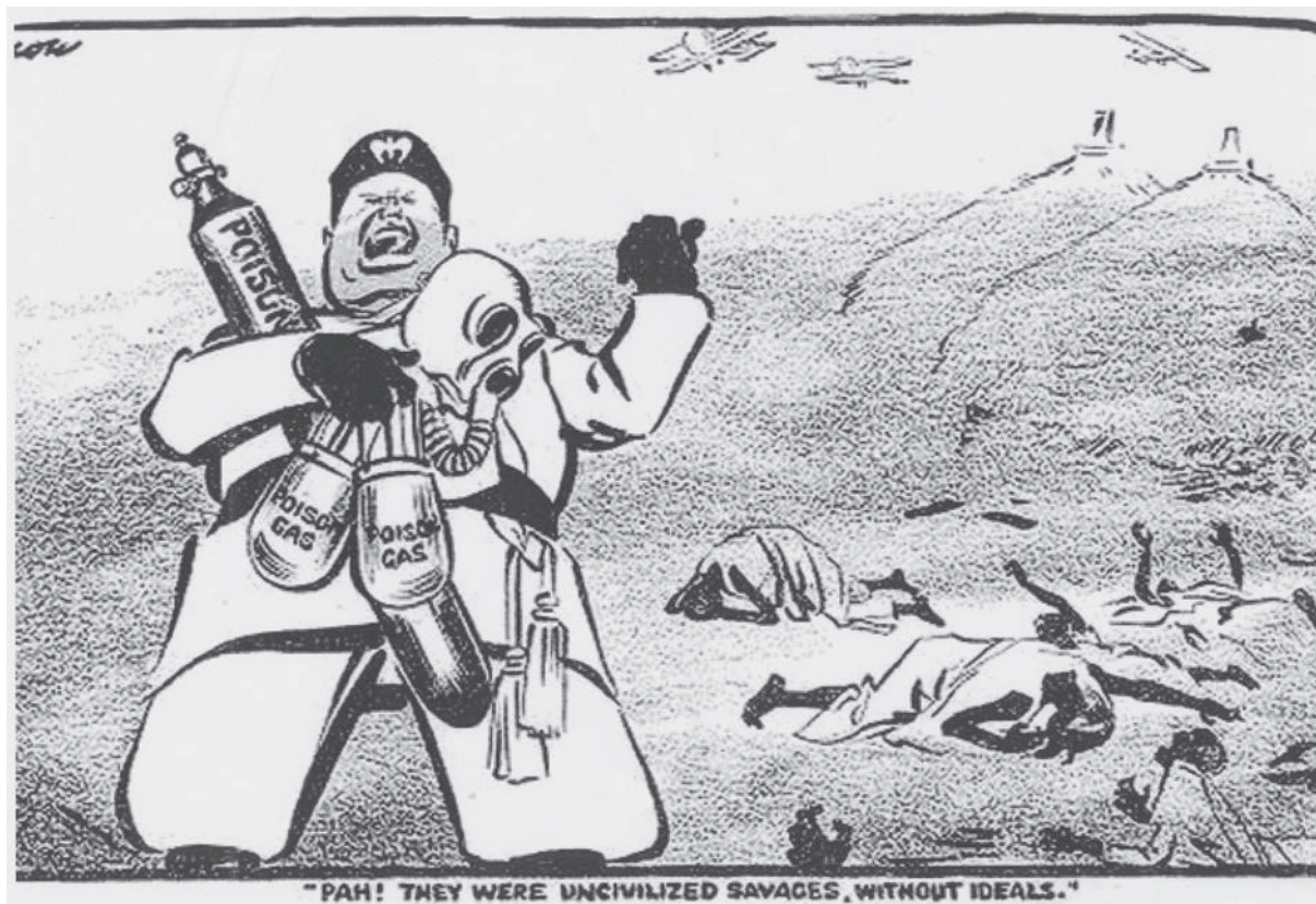
A cartoon published in an English newspaper, 3 April 1936.